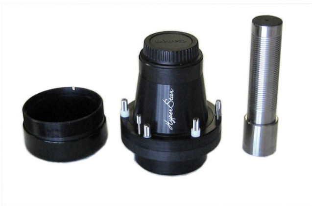
Secondary holder (shipped attached to lens), HyperStar lens, and counterweight