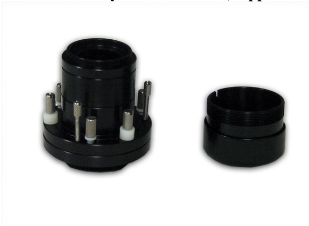
Secondary holder and HyperStar lens