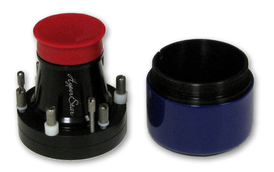
Holder removed to accept secondary mirror