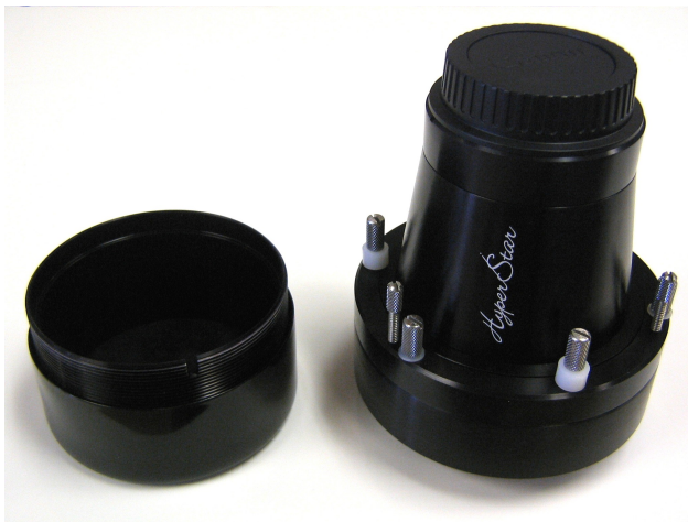
Secondary holder (shipped attached to lens) & HyperStar lens